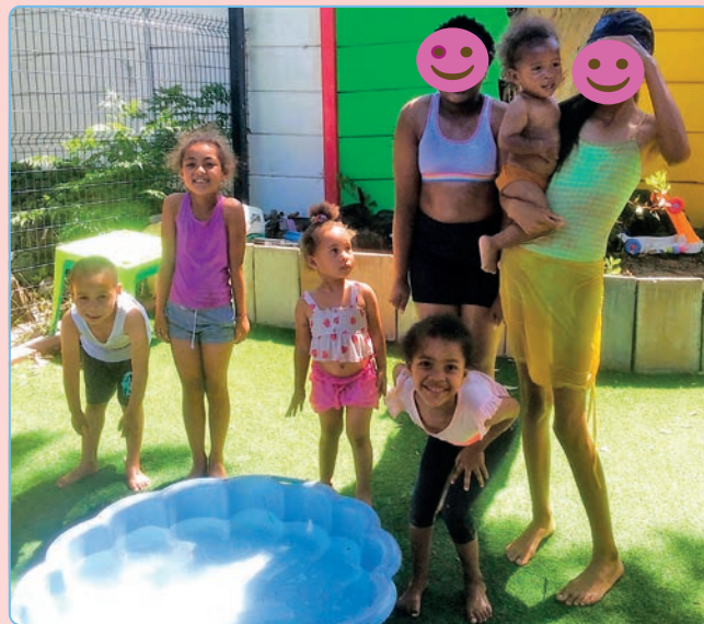
Fun and cooling down from the heat, with smiles all round!

"Be mindful. Be grateful. Be positive. Be true. Be kind."