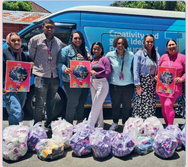
Teleperformance donated much needed sanitary towels.