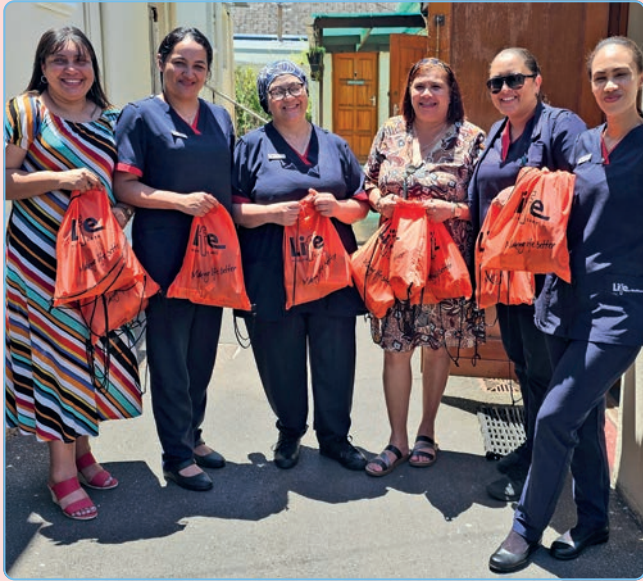
Life Kingsbury Hospital Staff donated pamper packs.

Thank you for your generous donations in kind.