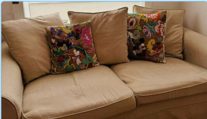
Sophie, a volunteer from Germany : 'A little bit of colour in the couch.'