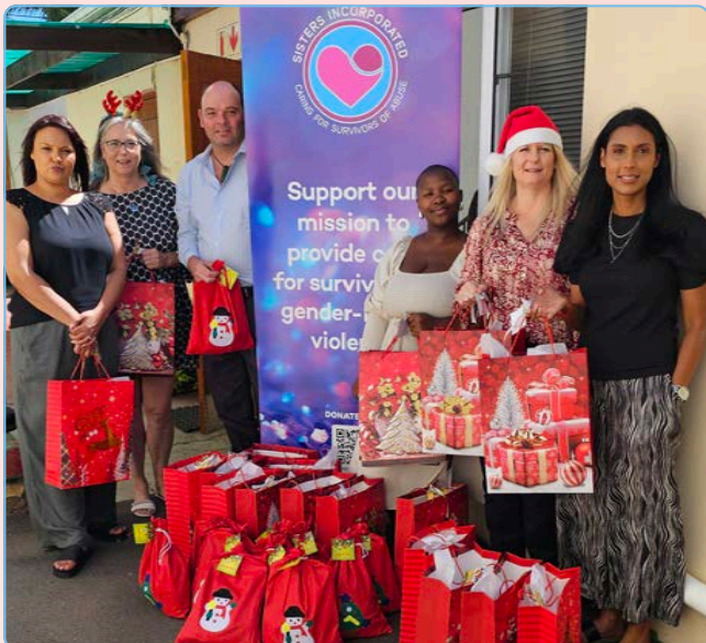
Relocation Africa brought joy to the residents by donating Christmas gifts.